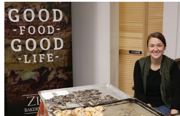
Zig's Bakery was one of the stop's for this year's Chocolate Walk.

... Dutch Wonderland . The park once again made visits with a Quiet Santa available for Schreiber families to have photo sessions with a professional photographer to get their holiday pictures. More than a dozen families signed up.