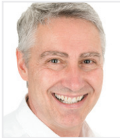
Jay Graver Preschool 30 years in April