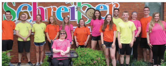
Camp Schreiber Staff