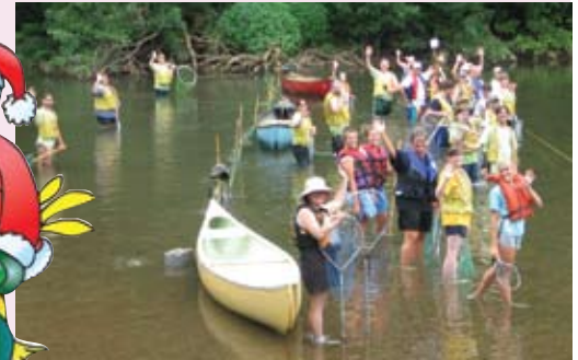
Duckie "catchers" eagerly await the arrival of the lead Duckies.

Duckie supporters and racers enjoyed a day of fun in the sun at Lancaster County Park beginning with the Second Annual Duckie Dinghy Derby, where teams of four rowed their way to victory down the same waters as Duckies. The winning team, The Sequined Sailors from Sequinox, were crowned top Duckie of the Race, with best costumes going to The VFW Bombers from Lancaster VFW Post 1690. Teams raised funds to benefit the Schreiber Center in a chance to compete for glory and the honor of Duckie Dinghy Derby Champion. The fun continued with a visit from the big guy himself—Santa Claus—in honor of this year's Race theme, giving little racers the chance to get a head start on their holiday wish lists.